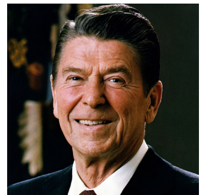
President Ronald Reagan Feb. 6, 1911 – June 5, 2004

I've never been able to understand why a Republican contributor is a 'fat cat' and a Democratic contributor of the same amount of money is a 'public-spirited philanthropist'.