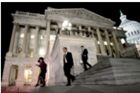
WORKING 'INTO THE NIGHT... let's hope they get this right!