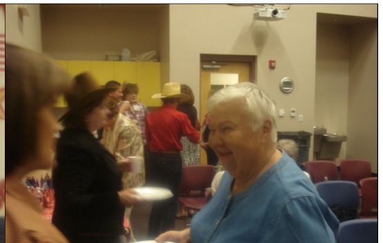
CRW celebrated Reagan's Centennial at the April meeting